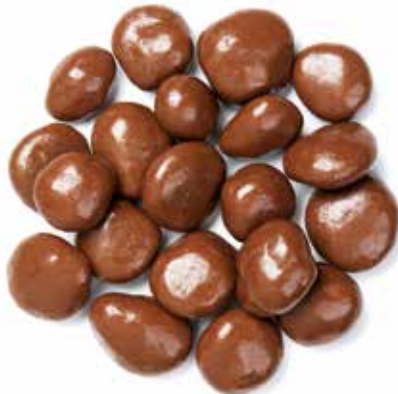
MILK CHOCOLATE COATED MONTMORENCY