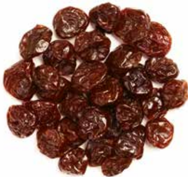
SWEETENED (W/APPLE JUICE CONCENTRATE) TART MONTMORENCY