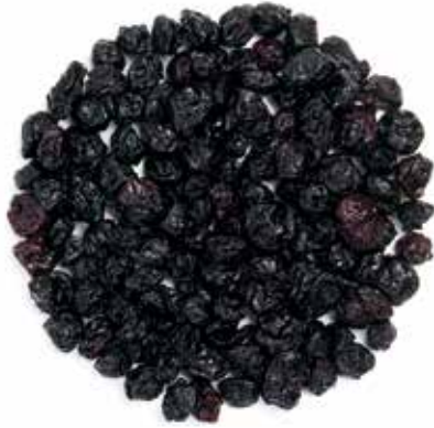
SWEETENED (W/APPLE JUICE CONCENTRATE)