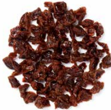
SWEETENED* DICED MONTMORENCY 3/16 x 1/4 inch