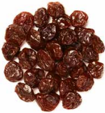
SWEETENED* TART MONTMORENCY