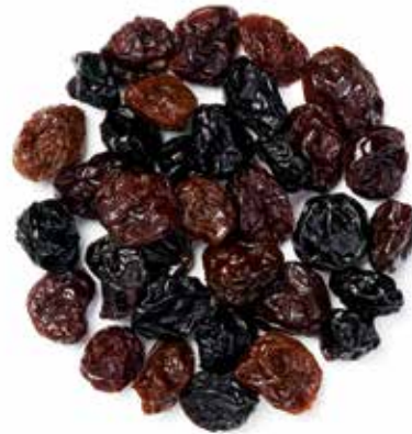
SWEETENED* CHERRY JUBILEE Montmorency, Balaton & Light Sweet