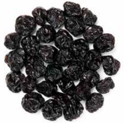
SWEETENED* TART BALATON