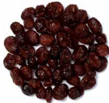
SWEETENED SLICED (W/APPLE JUICE CONCENTRATE)