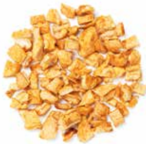
UNSULFURED DICES \frac{3}{4} \times \frac{1}{2} \times \frac{1}{4} inch