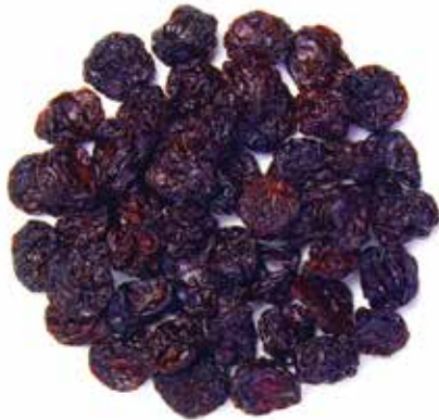
NO ADDED SUGAR TART MONTMORENCY