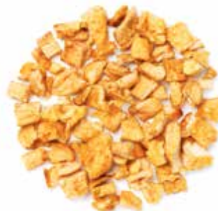
APPLE DICES \frac{3}{4} \times \frac{1}{2} \times \frac{1}{4} inch