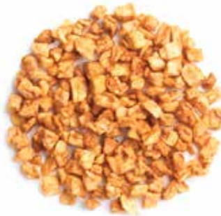
UNSULFURED DICES \frac{3}{8} \times \frac{3}{8} \times \frac{3}{8} inch