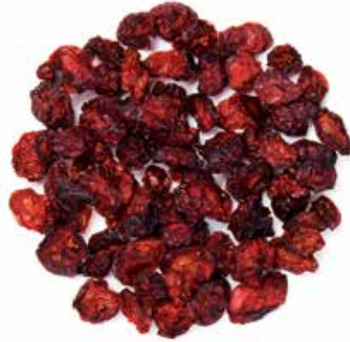
NO ADDED SUGAR SLICED