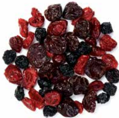
SWEETENED* CHERRY BERRY BLEND cherry, cranberry & blueberry