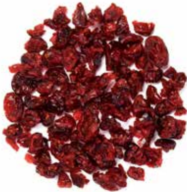
SWEETENED* DICED 3/16x1/4 inch