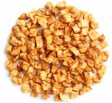
UNSULFURED DICES \frac{1}{2} \times \frac{1}{2} \times \frac{1}{2} inch