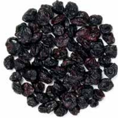
SWEETENED* LARGE CULTIVATED