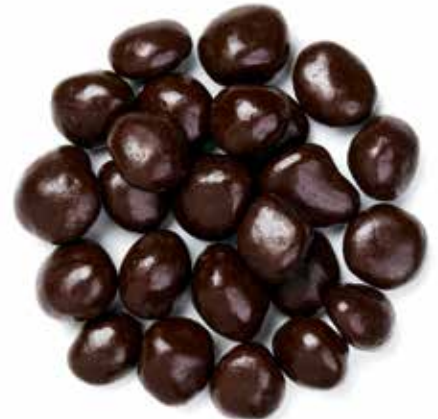
DARK CHOCOLATE COATED MONTMORENCY