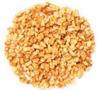
UNSULFURED DICES \frac{1}{4} \times \frac{1}{4} \times \frac{1}{4} inch